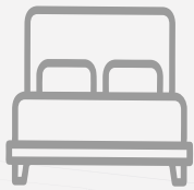
Bedroom 1 king Size Bed