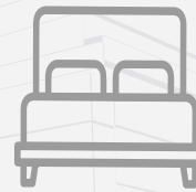
Bedroom 3 king Size Bed