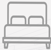
Bedroom 2 king Size Bed